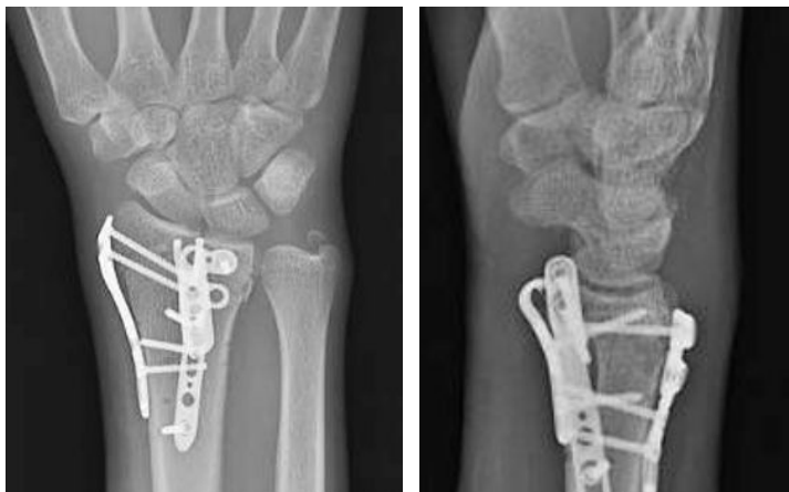
2 weeks post-op x-rays

At the 2 week post-operative appointment, splint was removed. Radiographs showed no evidence of secondary displacement. The patient was taught self-directed therapy to allow for flexion, extension, supination, and pronation with active, active-assist and passive range of motion. 3 to 5 pounds (1 to 2 kg) weight bearing was allowed to encourage return to activities of daily life. A removable wrist splint was given for patient to wear when more durable activity was performed.