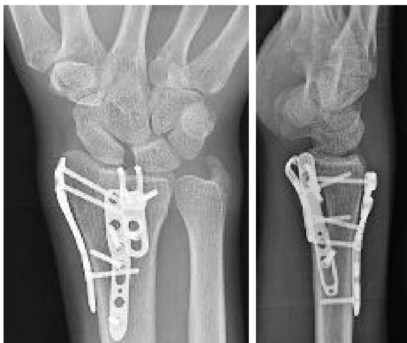
16 weeks post-op x-rays

The patient had returned to manual labor on a ranch at approximately 8 week post-op, denying any function limitations when performing his job but occasionally wear a brace due to swelling. After 16 weeks, the patient denies any limitation and working lifting up to 125 pounds (56 kg) daily.